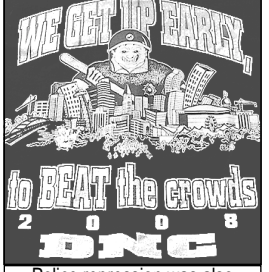
Police repression was also rampant in Denver for the DNC, where the police union made this "hilarious" t-shirt.

I-Witness Video, a New York-based collective that videotapes demonstrations to protect civil liberties, reported another story from the convention on September 4. St. Paul Police entered I-Witness Video's office carrying batons and a battering ram based on an unfounded report of hostages in the office. The police at first refused to leave even